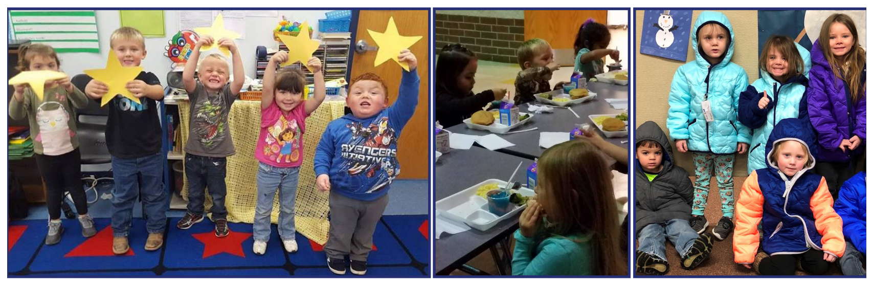
Left Photo: Students in Upper Sandusky's Head Start classroom celebrated the program's 5 star rating.

Head Start successfully implemented four additional full day classrooms at our Angeline, Kenton and Findlay (2) sites. Community partnerships continue to be strong in our four county service area. We have contractual relationships with both Hancock County and Hardin County Job and Family Services to provide transportation assistance to the program. We also partner for SNAP Education from the Ohio State University Extension Office and work with public libraries, local fire and police departments, health organizations, and more. Our Upper Sandusky and Forest sites received five star ratings through Ohio's Step Up To Quality rating system for early childhood programs.