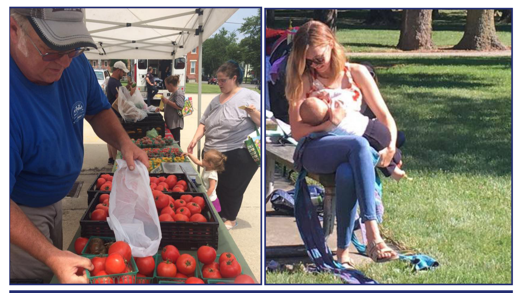
Nutrition Card Mitrition Card