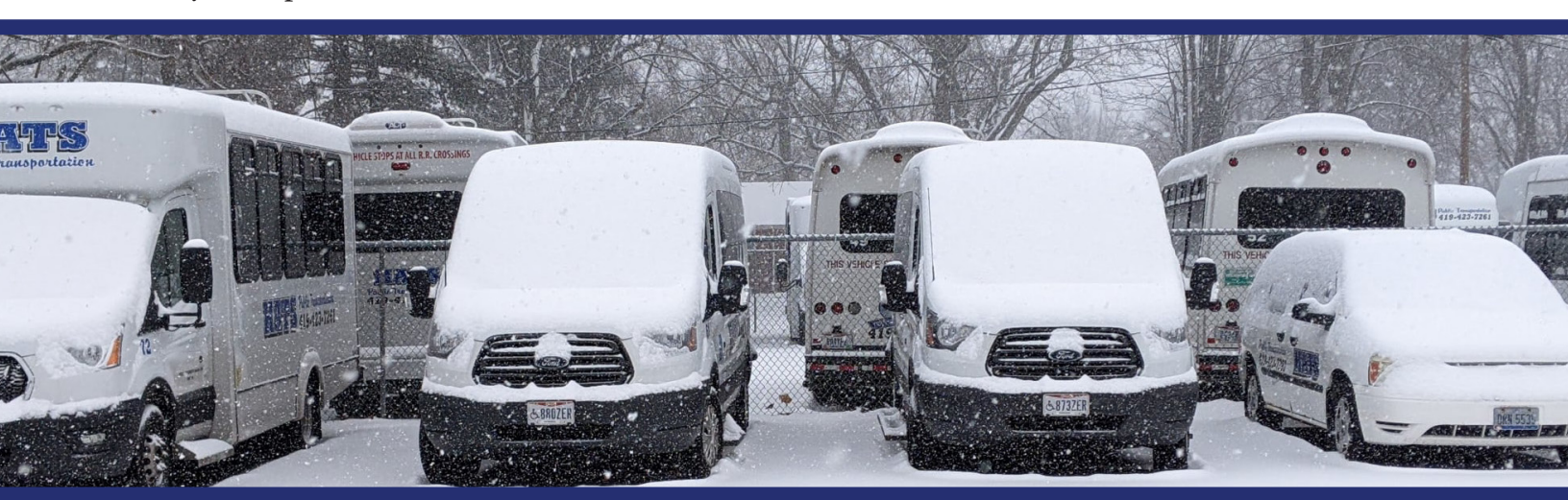
Photo: Many riders opt to take HHWP CAC's transportation services rather than drive in snowy weather. Our staff arrives early to clean off and warm up the vehicles.

Our Mobility Management program serves residents of both Hancock County and Wyandot County with a customer-centered approach to solving transportation issues. A Mobility Manager provides information and referral for individuals seeking help finding transportation to work, medical appointments, and more. To gain input on our coordinated transportation plan, focus groups were held involving 12 participants. Those sharing their expertise came from low-income households, were senior citizens, or people with disabilities. In 2021, 70 people with complex transportation needs were directly assisted with referrals or services from the Mobility Manager. HHWP CAC also coordinates with other agencies, transportation providers, community leaders and interested citizens to creatively address community transportation needs.